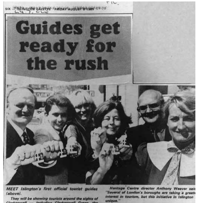
1986: Some of the first guides show off their new Clerkenwell badges to the Islington Gazette photographer