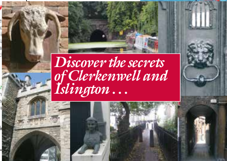
1990 to 2018 : a selection of publicity material from the council and CIGA. The leaflet (left) is advertising the regular 'rota' walks, now discontinued