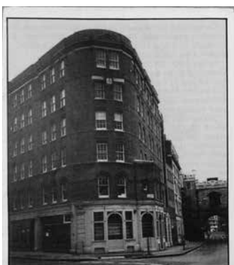
CLERKENWELL HERITAGE CENTRE

Described by one of the first guides as 'energetic and forceful', Weaver was dubbed by the local newspapers as 'Mr Clerkenwell' and at first there was scepticism from them about the project. A later headline mockingly referred to 'Costa del Islington'. 4 But in fact there had been other moves from different quarters, including the Government, to encourage tourism away from the capital's familiar sites. Prince Charles, Kenneth Baker and other ministers were given tours of Clerkenwell to highlight the possibilities of 'urban tourism'. 5 Post-war, there had been a steady improvement in the standard of guiding and the training of guides, notably the establishment of the Blue Badge scheme. Almost all guides at this time found their work either in the high profile areas of London like Westminster and the West End, or outside London to popular tourist destinations,