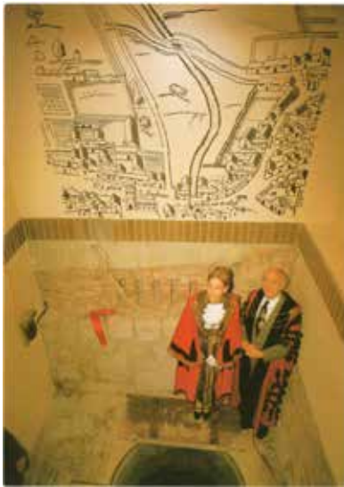
1985: The Mayor of Islington and the Master of the Worshipful Company of Parish Clerks at the opening of the Clerks' Well – in the days before risk assessments!