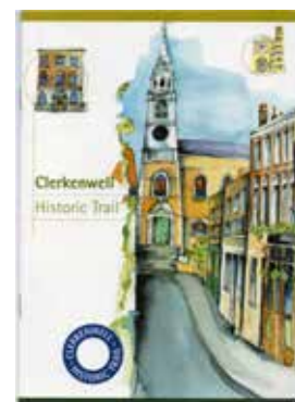
The Clerkenwell Historic Trail and (above) pavement marker