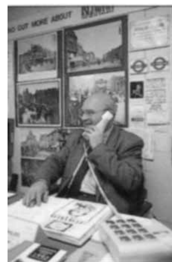
The Visitor Centre in Duncan Street